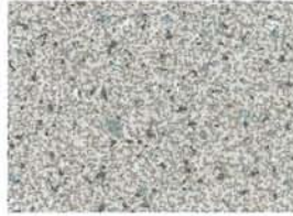
692 Folkstone Celesta