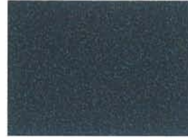
7018 Navy Grafix