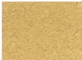
7813 Cardboard Solidz