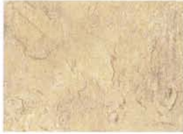
7022 Natural Canvas