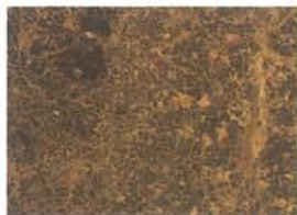
3454 Parquet Café