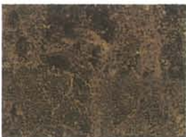
3455 Parquet Noche