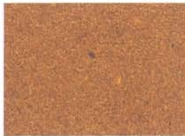
3503 Russet Solidz