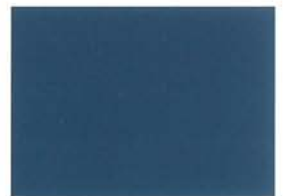
914 Marine Blue

For selections other than standard colors, contact Metpar for price.