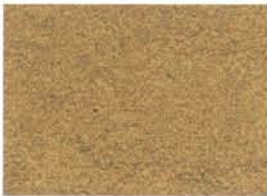
7812 MDF Solidz