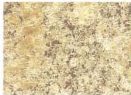
6223 Venetian Gold Granite