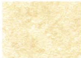
726 Almond Papyrus