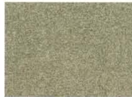
7815 Nature Solidz