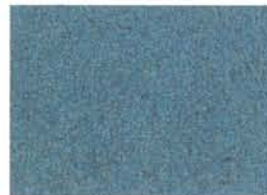
3502 Breeze Solidz