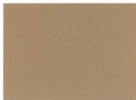
913 Indian Smoke